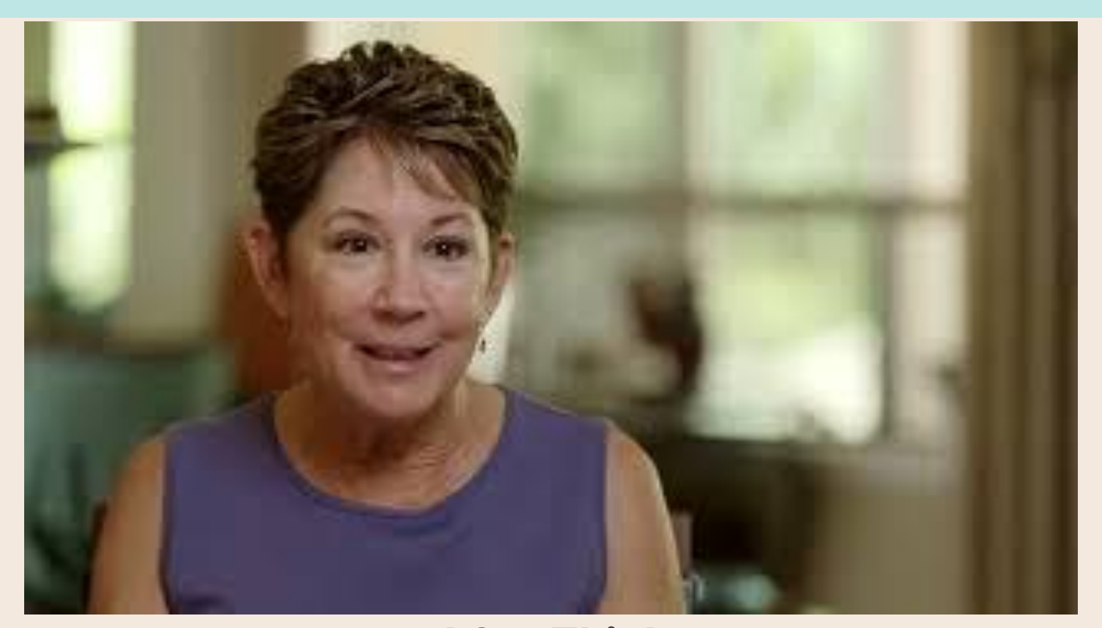
I Got This!